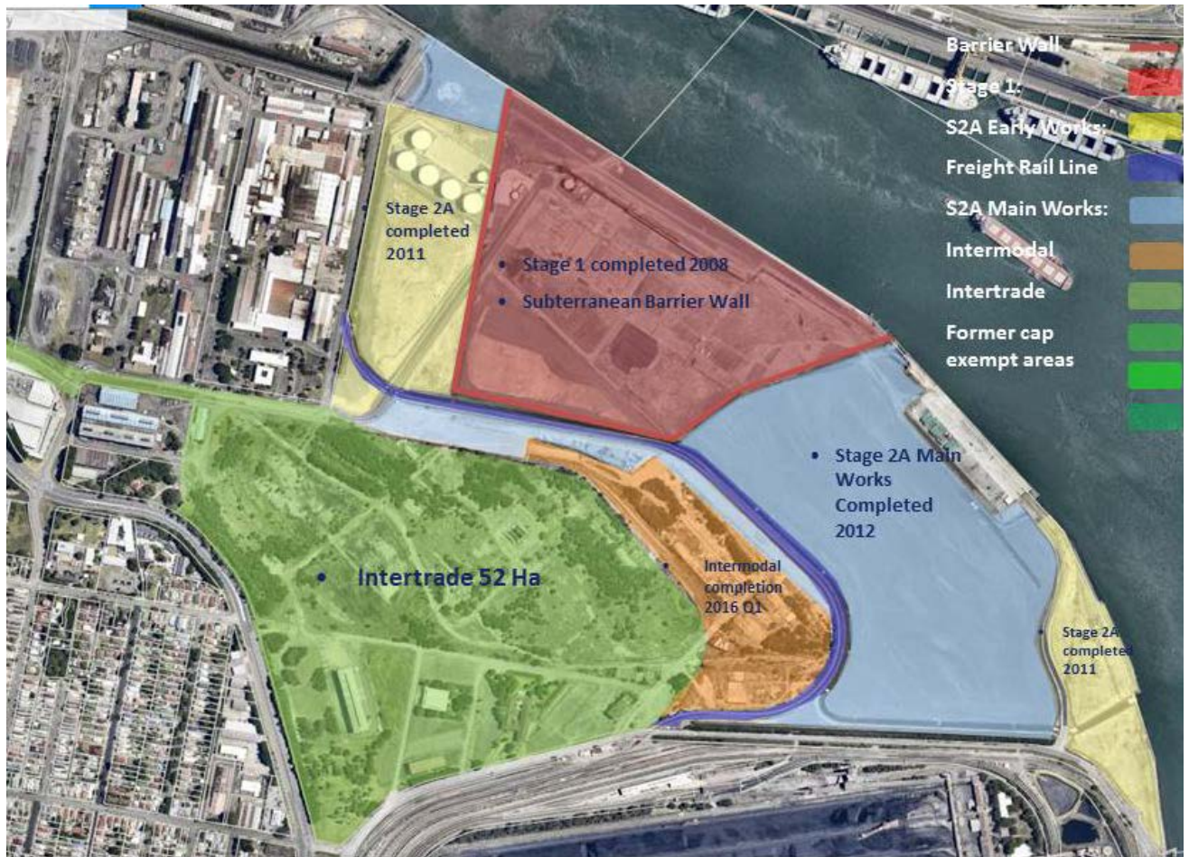
MAYFIELD FORMER BHPB SITE: REMEDIAITON AND INFRASTRUCTURE STAGING PLAN

Since the early 2000s, the Hunter Development Corporation (HDC) and its predecessor, the Regional Land Management Corporation, has been the state's agent responsible for carrying out important remediation activities across former BHP landholdings around the Port of Newcastle at the former Steelworks site at Mayfield and its associated Waste Emplacement Facility at Kooragang Island. HDC has methodically completed complex, large scale remediation works progressively, with accompanying monitoring and verification programs to ensure adherence to environmental standards. This important work will ensure the sites are fit for re-use in the future to support the regional economy.