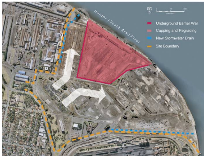
STAGE 1: DIAGRAM OF AREA 1 and BARRIER WALL IMPACT (Stage 1 shown in red shading)

Monitoring and reporting has been undertaken for environmental authorities.