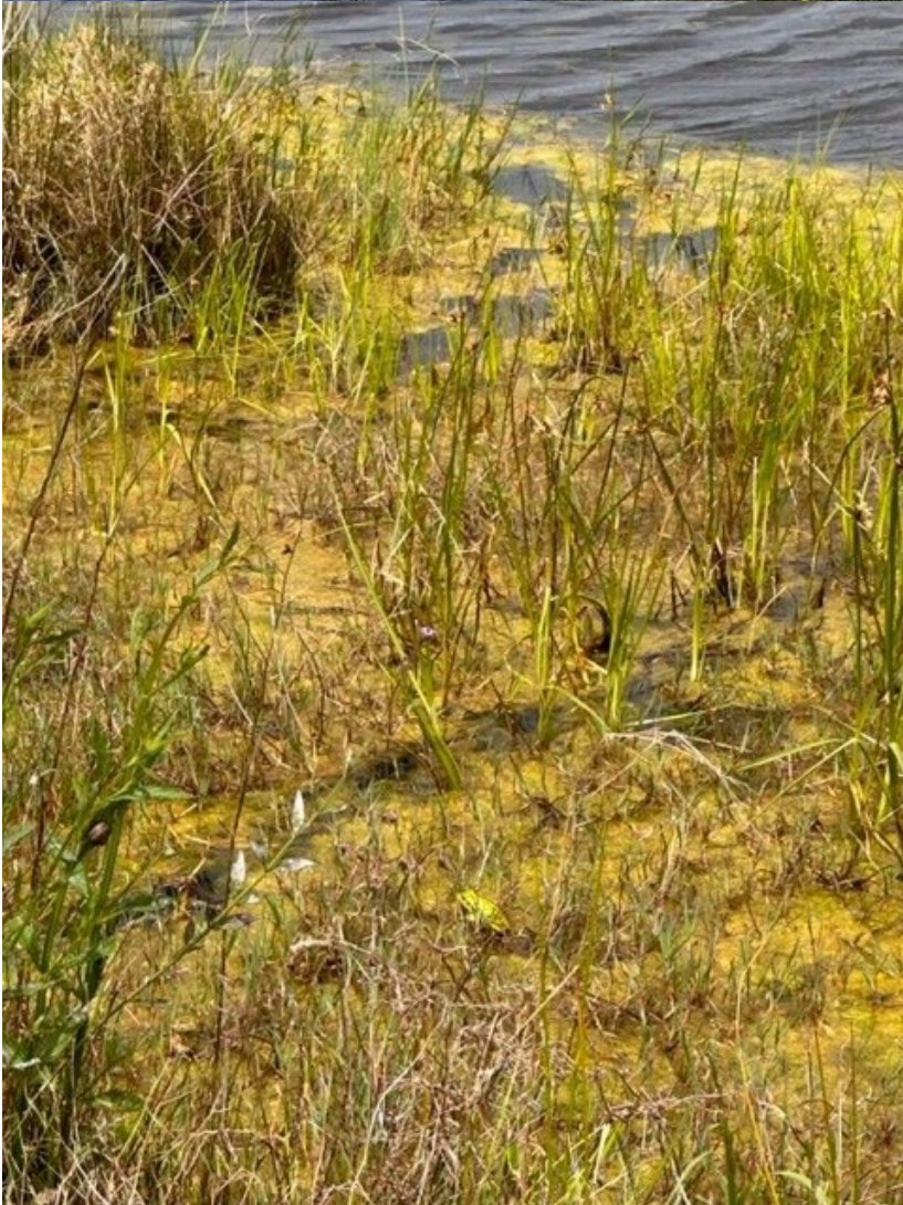
GGBF in Constructed Pond in K5 Area