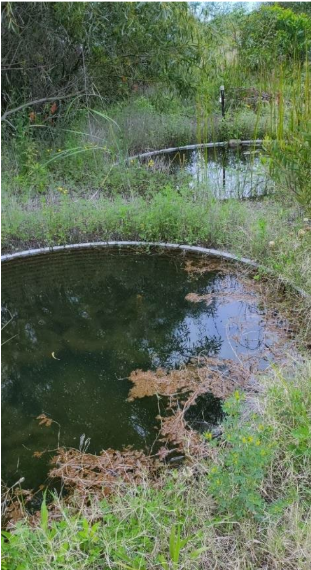
GGBF habitat areas K7 area