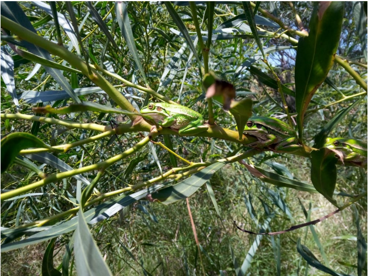
Photograph 3.1 GGBFs utilising Acacia saligna tree

Acacia was actively being removed by contractors to maintain the integrity of the capping layer during the site inspection, and HCCDC has advised (G. Moylan pers comms) that the vegetation removal program has now been completed under the supervision of ecologists.