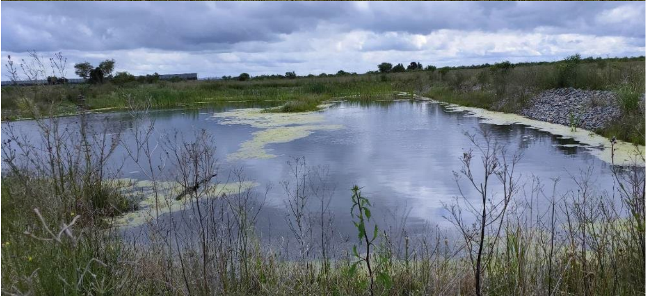
Constructed ponds in the Wedge area