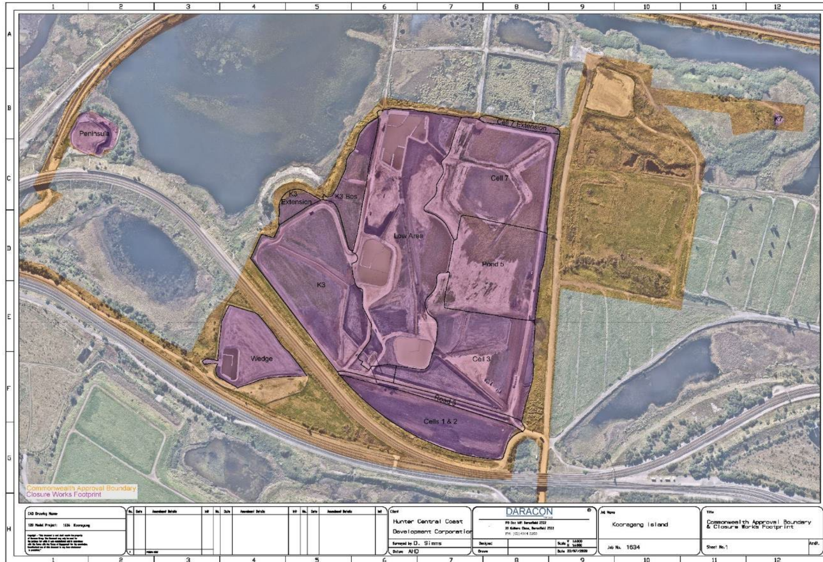
Figure 1.1 Area 2 Works site