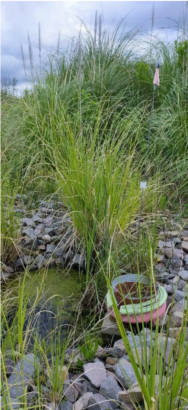
Habitat areas K2 North Area