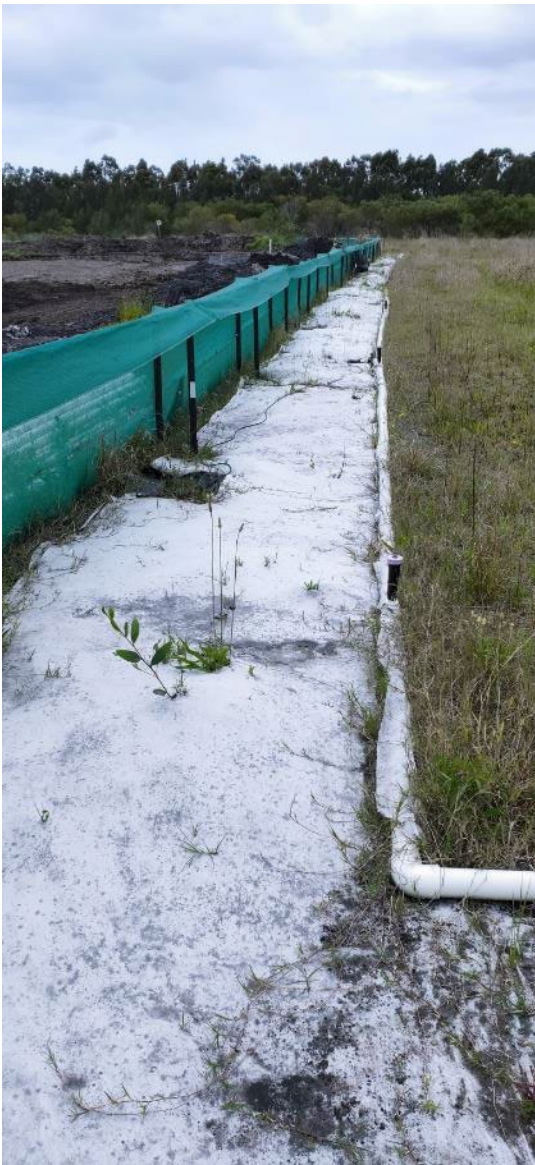
Typical GGBF fencing arrangements