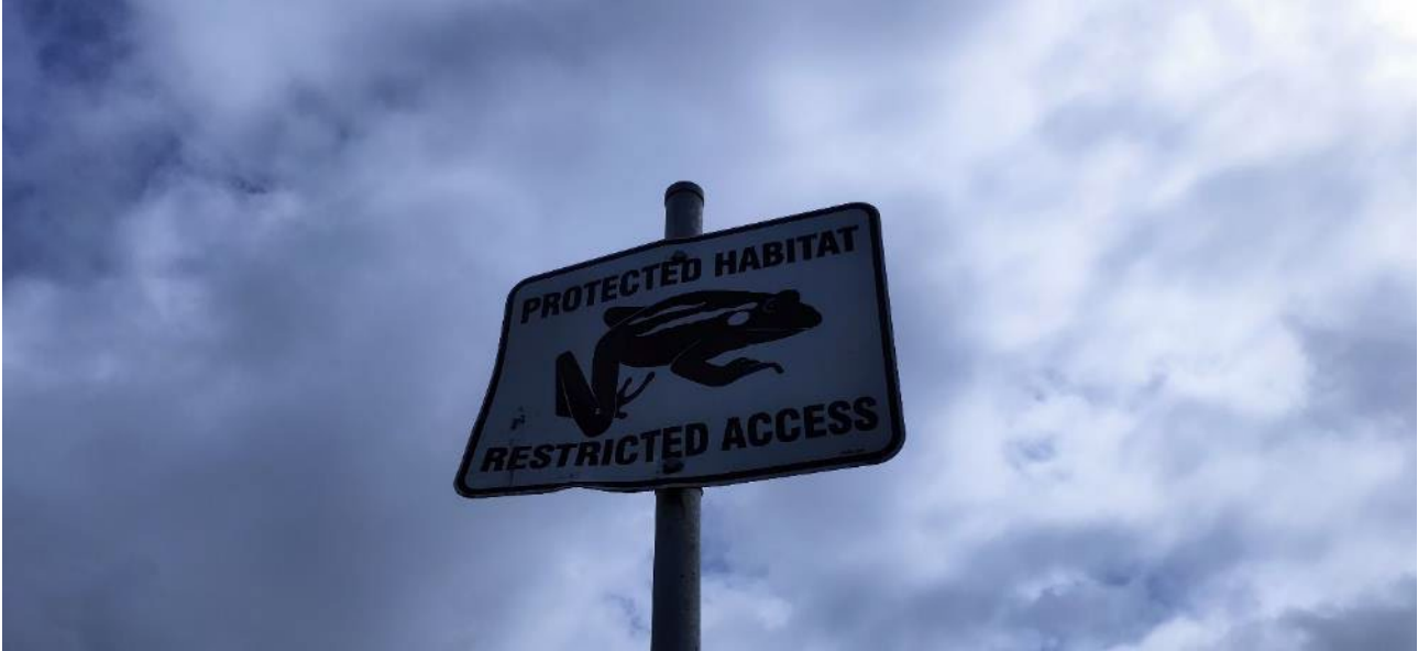
Frog habitat area signage