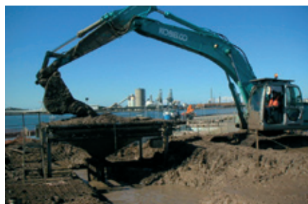
Work has started on the $110M remediation of the Mayfield site.

In May 2006, construction commenced at the Mayfield site on the Hunter's largest ever industrial site remediation project.