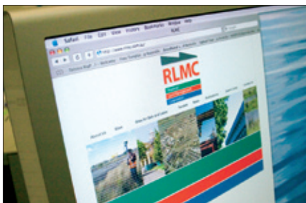
The RLMC website is one way people can monitor our progress.

RLMC seeks to maintain positive and productive relations with other Government agencies, the communities surrounding its sites and the business community.