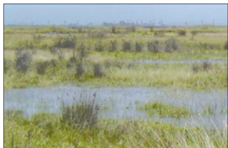
RLMC is helping to restore natural tidal inundation to part of the Tomago site

In addition to remediation works and allocation of land for environmental protection, RLMC has provided support to other important environmental projects.