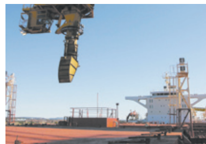
140ha of land has been allocated for a third coal loader at the Port of Newcastle.

The consortia of major mining companies is currently seeking the required planning and environmental approvals for its proposal to build a facility with two additional coal loading berths next to Port Waratah Coal Services' existing coal loader.